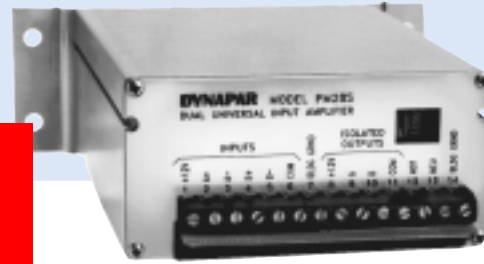
PM28S replaces PM21, PM25 and 101UA

Dual universal input amplifier . . . provides 6 types of input functions